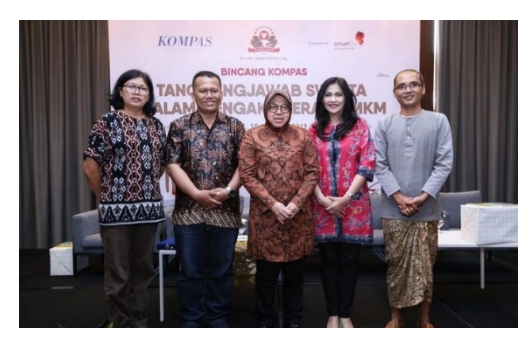
Photo 2. Surabaya Mayor with other guest speakers

- Surabaya Mayor, Tri Rismaharini, was a guest speaker at a media discussion on "Private Sector Responsibility Accelerating SMEs", which was organized by PT HM Sampoerna in Surabaya.<sup>25</sup> The Mayor also attended a launching event for the Sampoerna Academy in Surabaya together with the Head of the Surabaya City Education Office and Hamengkubuwono X.<sup>26</sup>