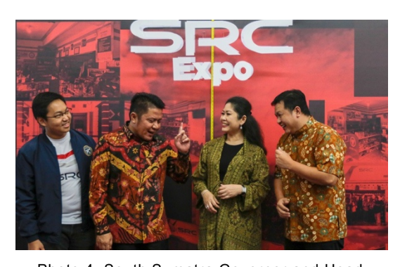
Photo 4. South Sumatra Governor and Head of Sampoerna's South Sumatra Region at the Sampoerna Retail Community (SRC) Expo in Palembang