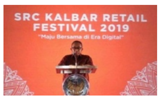
Photo 3. West Kalimantan Governor Sutarmidji at the SRC Kalbar Retail Festival