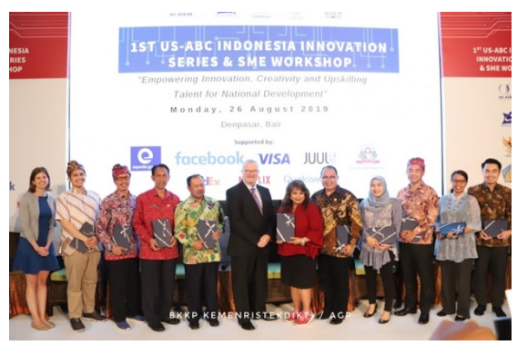
Photo 11. 1st US-ABC Indonesia Innovation Series & SME Workshop in Bali, 26/08/2019.