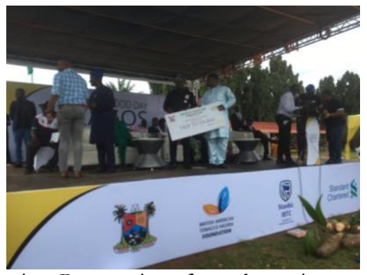
Caption: Presentation of awards to winners by the BAT foundation in the Lagos farm fair on 16<sup>th</sup> Oct. 2018

BAT Foundation's CSR activities endorsed by Lagos State Government<sup>17</sup>