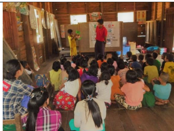
Photo: JTI Foundation providing drinking water supply in Kayin State