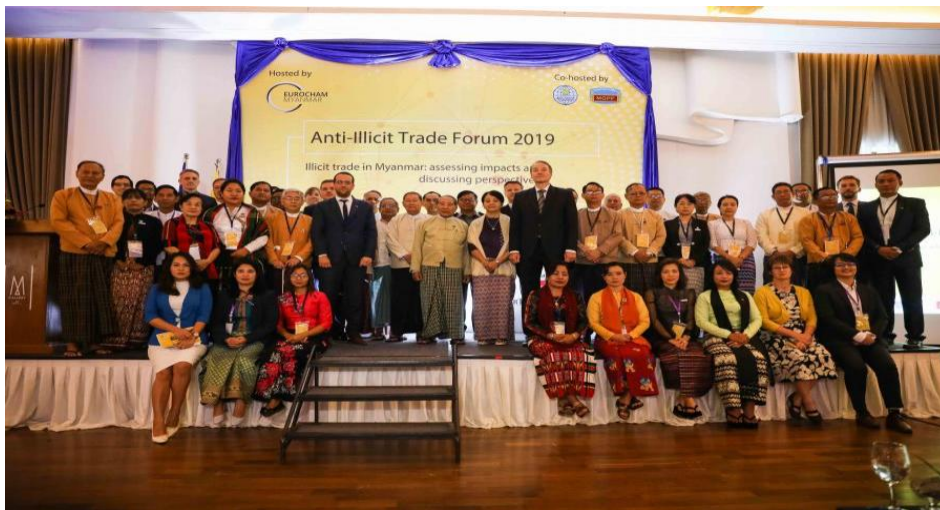
Anti-Illicit trade forum, 19 Sep2019

Among EUROCHAM’s objectives are: “Coordinate regular consultation meetings between the group and the authorized government officials to develop a shared understanding of challenges and issues.”