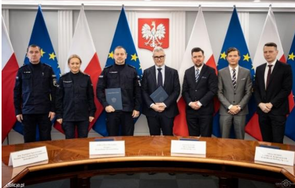
Representatives of the Police together with representatives of JTI after signing the agreement