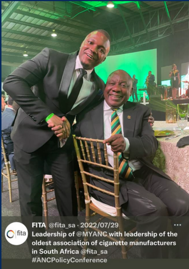
State President and the FITA chairperson