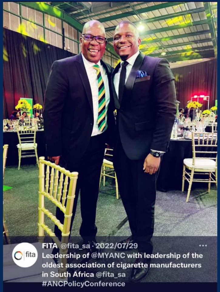
ANC Gauteng Chairperson and FITA chairperson