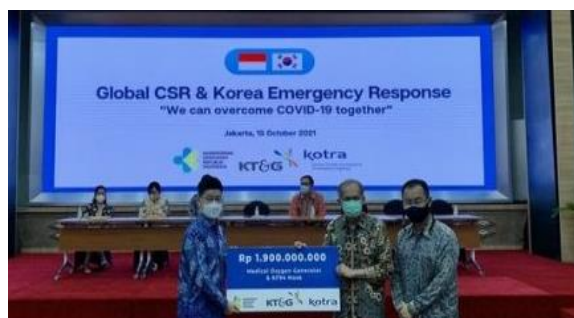
Ministry of Health Representative Received Covid-19 Response Fund from Korean Tobacco & Ginseng in Jakarta, Oct 15, 2021.

There were massive involvement of tobacco companies in non-tobacco related activities, such as COVID-19 handling, vaccination programs, training activities for persons with disabilities, environmental activities, and charity events. The involvement of tobacco companies in these activities serves as a form of corporate social responsibility (CSR) and aims to improve their public image and strengthen their relationships with the government and local communities. Moreover, tobacco companies have made donations or provided the assistance to government agencies or organizations during the COVID-19 pandemic. The donations are generally in the form of medical equipment, such as oxygen concentrators or rapid antigen tests, and the events are attended by government officials or representatives. The companies involved include KT&G from Korea, PT Djarum, and PT HM Sampoerna.