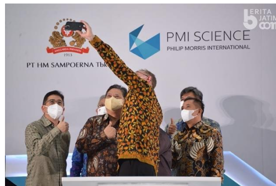
President Director of PT HM Sampoerna, Mindaugas Trumpaitis doing a 'Wefie' with the Coordinating Minister for Economic Affairs and Minister of Investment along with several government officials during the inauguration of the IQOS factory investment realization in Karawang, November 30, 2021.

Meetings between government officials and the tobacco industry in policymaking processes are considered normal and legal. Several customs and excise offices have worked with business entities, including PT HM Sampoerna, to promote economic growth under the Customs Visit Customer (CVC) program.