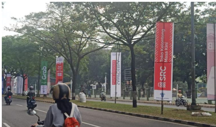
Banners bearing the names of Sampoerna and the Ministry of Investment were placed along the road to promote the Online Single Submission (OSS) program.

The government also accepts, endorses, and enters into partnerships with the tobacco industry. In 2021, the Ministry of Investment (BKPM) collaborated with PT HM Sampoerna to promote the online single submission (OSS) program for small and medium-sized businesses in Indonesia by conducting a roadshow to various cities. This collaboration was supported by the Minister of Cooperatives and SMEs and the Minister of State-Owned Enterprises.