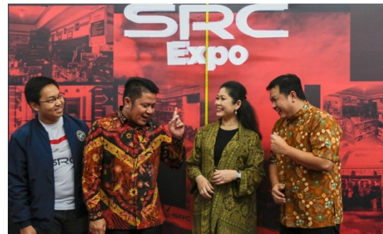
Photo 4. South Sumatra Governor and Head of Sampoerna's South Sumatra Region at the Sampoerna Retail Community (SRC) Expo in Palembang