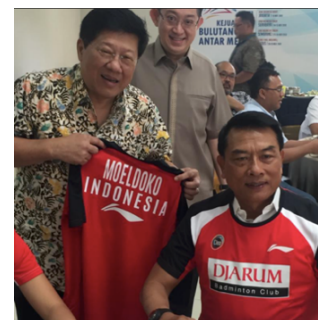
Photo 6. KSP Head seen wearing a Djarum Badminton t-shirt