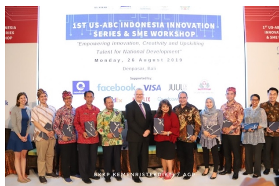
Photo 11. 1 st US-ABC Indonesia Innovation Series & SME Workshop in Bali, 26/08/2019.