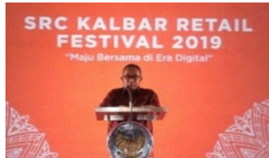
Photo 3. West Kalimantan Governor Sutarmidji at the SRC Kalbar Retail Festival