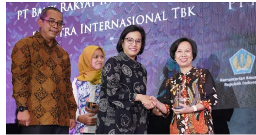
Photo 7. Finance Minister Presenting The Most Tax Friendly Corporate Award