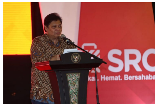
Photo 8. The Minister of Industry delivering his opening address at the 11 th SRC Anniversary in Jakarta

According to him, the tobacco industry is part of the country's national and cultural history, especially concerning the kretek cigarette industry . 65,66,67