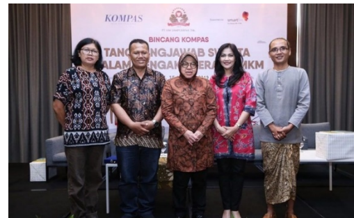
Photo 2. Surabaya Mayor with other guest speakers

- Surabaya Mayor, Tri Rismaharini, was a guest speaker at a media discussion on " Private Sector Responsibility in Accelerating SMEs ", which was organized by PT HM Sampoerna in Surabaya. 25 The Mayor also attended a launching event for the Sampoerna Academy in Surabaya together with the Head of the Surabaya City Education Office and Sri Sultan Hamengkubuwono X. 26