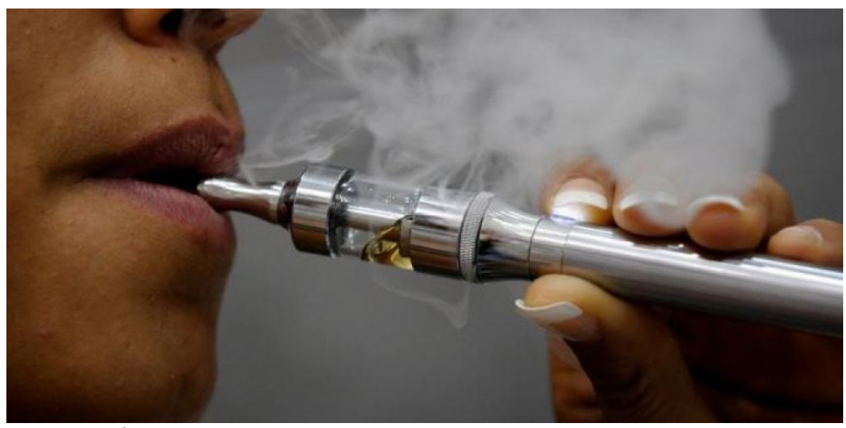
Question N° 2: Reldat pide al Gobierno de Panamá reconsiderar prohibición de cigarrillos electrónicos.

Reference site: <a href="https://bit.ly/3XY7kOs">https://bit.ly/3XY7kOs</a>