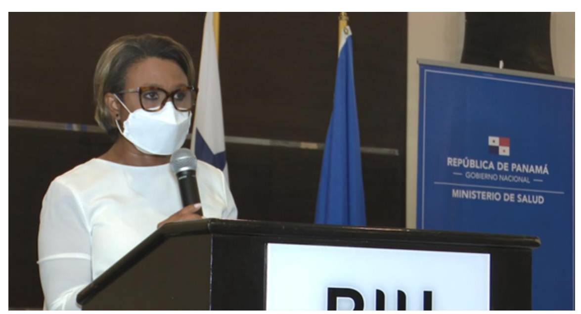
Question N° 19: Ministerio de Salud en Panamá lanza Proyecto FCTC 2030 para la implementación de medidas efectivas de control de tabaco a nivel nacional. Reference site: <a href="https://bit.ly/40n9Yig">https://bit.ly/40n9Yig</a>