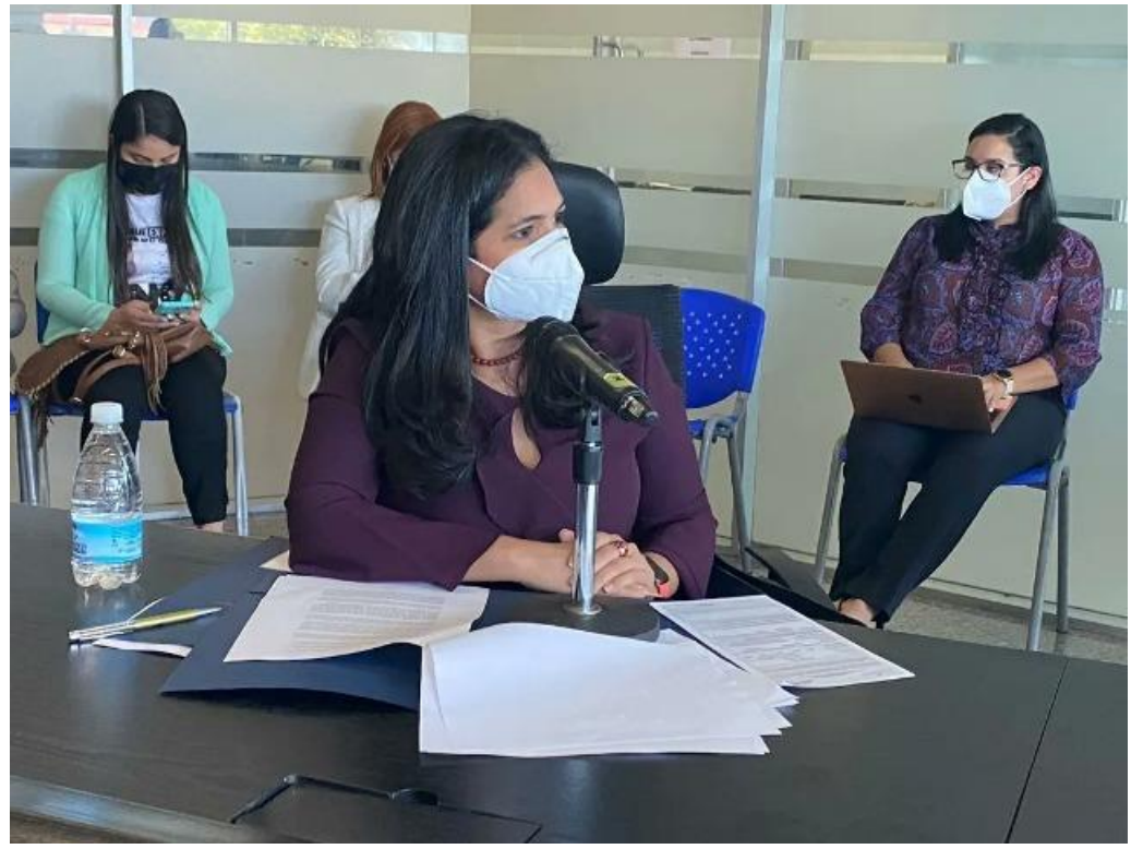
Question N° 12: Asamblea aprueba en primer debate dos proyectos sobre temas aduaneros Reference site: <a href="https://bit.ly/3jq3vmg">https://bit.ly/3jq3vmg</a>