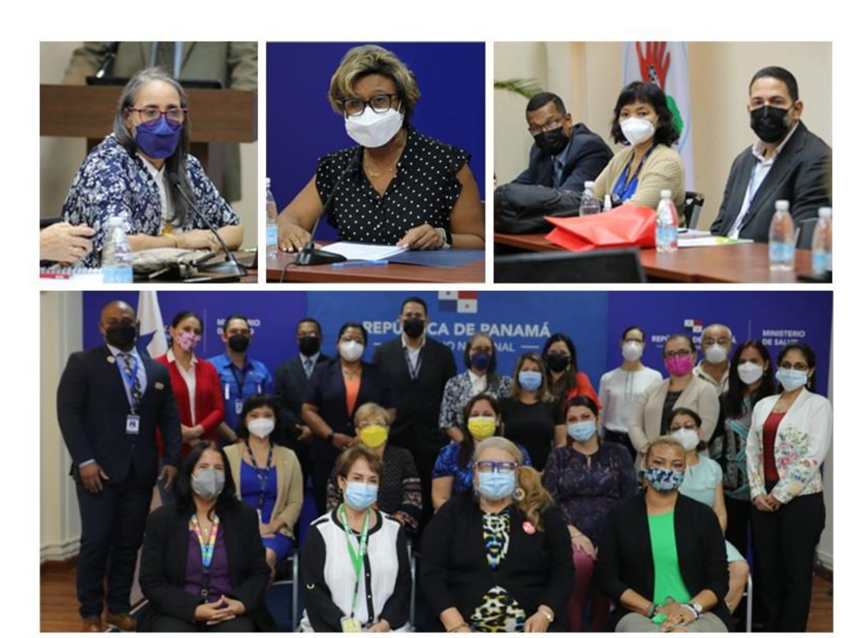
Question N° 2: Aduanas participa en instalación de Consejo para la salud sin tabaco Reference site: <a href="https://bit.ly/3wMu5cf">https://bit.ly/3wMu5cf</a>