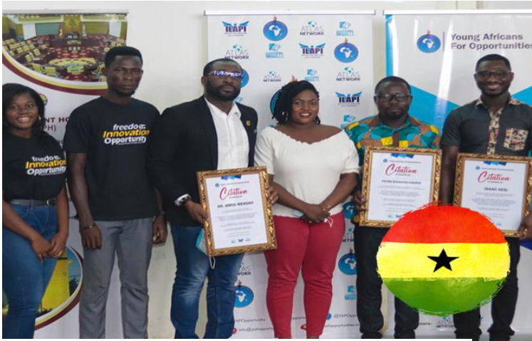
Figure 2: Image of YouOpportunity Summit 2021 sponsored by the Atlas Network