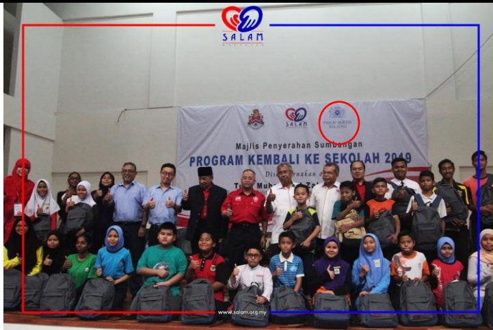
Photo: PMI is sponsor of the event whose logo appears together with logos of Yayasan Salam and government.