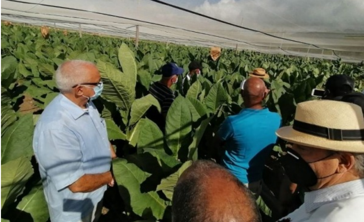
Figure 3 The elderly man with the hat is the former president of the Republic, Hipolito Mejía in a tobacco greenhouse.

In 1964 "he began a learning season at the American University of North Carolina to become familiar with the procedures of industrial tobacco processing... After completing his academic instruction, Mejía was hired by the INTABACO as an agricultural researcher. There he developed field work before becoming, in a very short time and with only 25 years, the chief director of this national body, being the fourth holder since the creation of the entity in 1962. With him at their head, INTABACO introduced the variety of blond for the industrial production of cigarettes." 49