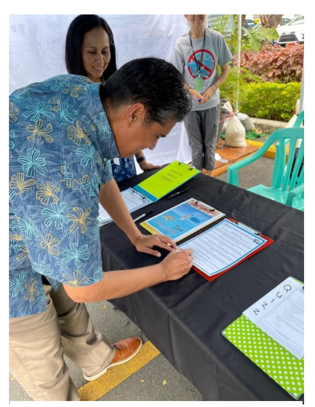
Palau's President Surangel Whipps Jr. signs Pledge at CTFP Our Oceans booth. Below, other visitors signing the Pledge.

Pledge available for Our Oceans booth visitors to sign.