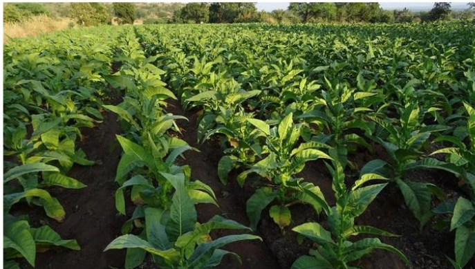
Il kentucky, materia prima del sigaro toscano, è il tabacco coltivato in Valtiberina

Avrà validità fino al 2025. Una boccata di ossigeno per i coltivatori della Valtiberina, terra di eccellenza per la produzione del kentucky