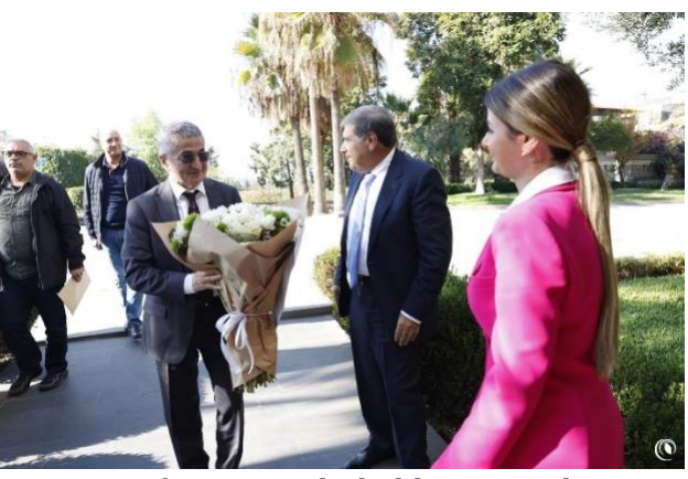
Minister of Finance El Khalil visiting the Regie

"the institution of hardworking that harmonizes the resources of the earth with the sweat of its descendants, to produce quality and returnable, preserving their decent and free living on the one hand, and providing the state and its treasury with revenues on the other hand, while today it is in dire need of every penny, to rise from its most difficult situation on financial, economic, social and various other fields, especially the political and constitutional complexities' (19 December 2022) 57.