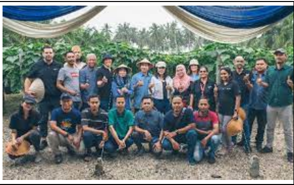
BAT unveils its "Beyond Benih" CSR project.