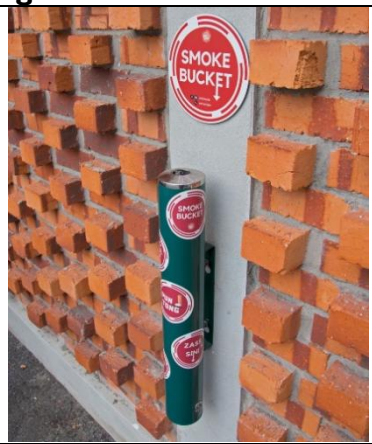
Philip Morris' cigarette but canisters across the country