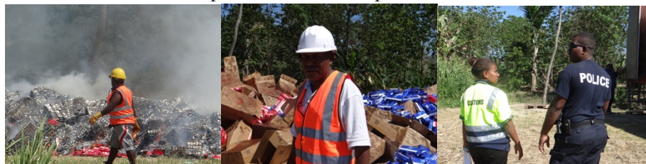
Photos of SITC representatives with police officer

There were some suggestions made by the tobacco industry to the Director Reform Unit, Ministry of Finance Treasury MFT to set up an illicit tobacco smuggling coordinating committee in 2019 but it was rejected.