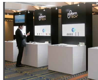
JT’s lunch of Ploom TECH+

To maintain sustainability of the business, Japan Tobacco wants to ensure the company is “included in policymaking leading to fair and balanced regulation and enhance our cooperation with governments to combat illegal trade.” 3 JT will also continue to engage with law enforcement agencies. JT has identified tax increase as a risk to its business and its strategy to mitigate this is to promote understanding among relevant authorities that “substantial or repeated tax increases do not necessarily serve their purpose.” 3