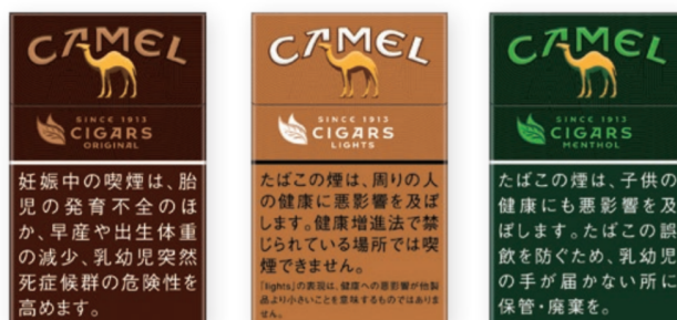
JT launched new little cigar products in 2019

Transnational tobacco companies showcase Japan as the world leader in heated tobacco products however its growth has slowed. Since its introduction in Japan, it occupies 23% of JT’s total domestic tobacco market. In 2019, JT launched Ploom TECH+ in June and Ploom S in August domestically. JT cigarette sales volume decreased 7.9% to 75.5 billion units due to cigarette volume decline caused by a tax increase. JT launched little cigar products in 2019 as a measure to prevent consumers from switching to other international brands sold in Japan.