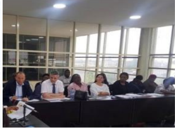
Group photograph of representatives of the tobacco industry at the two-day meeting on the draft standard on other combustible tobacco products and Heated Tobacco Products (HTPs) organised by the Standards Organisation of Nigeria in October 2019