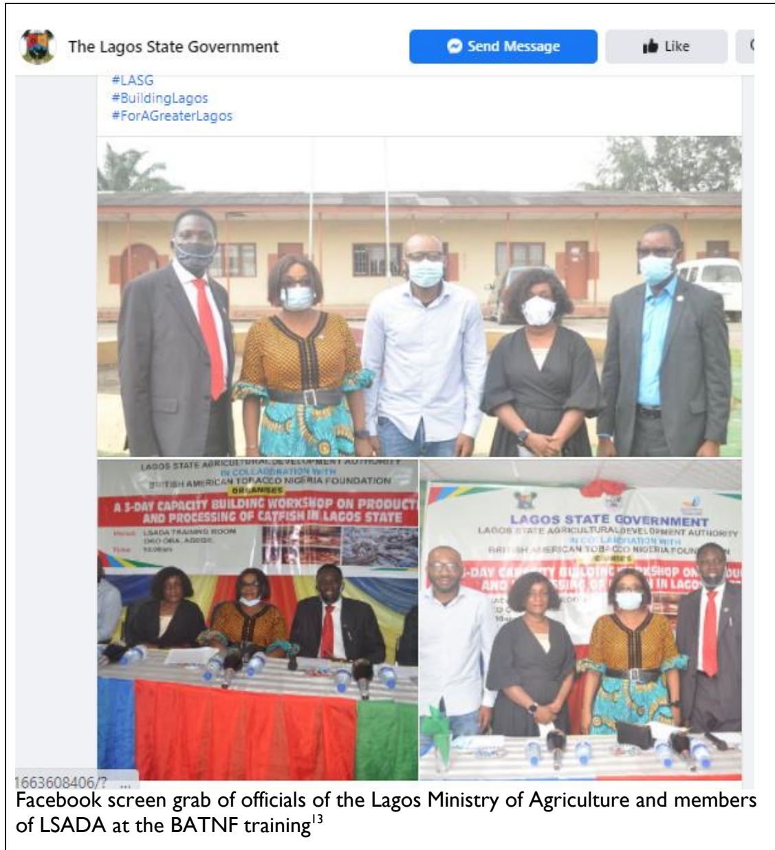
Facebook screen grab of officials of the Lagos Ministry of Agriculture and members of LSADA at the BATNF training 13

There is substantial evidence that top level government officials engage in unnecessary interactions with tobacco companies and attend their functions. In November 2020, the Lagos Commissioner for Agriculture, Ms. Bisola Olusanya commended BATNF for its continuous support to the development of agriculture in Lagos at an event organised by the Lagos State Agricultural Development Authority (LSADA) in collaboration with the BATN Foundation to train catfish farmers 12 in the state.