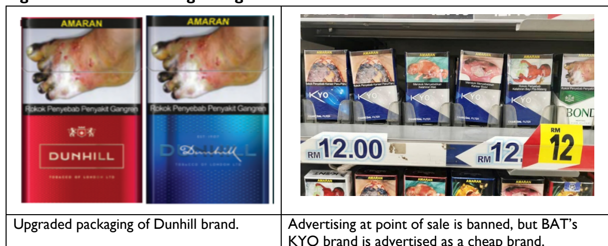
Figure 2: BAT marketing its cigarettes in 2020

Over the past six years, Malaysia has not made any progress in implementing Article 5.3 guidelines of the WHO Framework Convention on Tobacco Control (FCTC) and is faring poorly in protecting public health policies from interference from the tobacco industry (TI). As a result, several tobacco control policies have been put on hold, delayed or derailed. These include tax increase on tobacco, standardized packaging of tobacco, ban on pack display at points of sale and licensing of retailers to sell tobacco. The tobacco industry and those representing its interests (such as retailers, chamber of commerce, research entities) have applied pressure on the government and interfered against these measures.