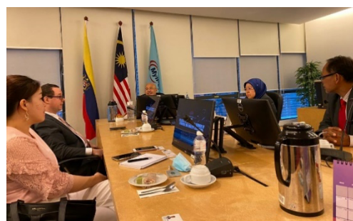
8 August: EUROCHAM’s meeting with the DG of Intellectual Property Corporation of Malaysia (MyIPO)

9. The government accepts assistance/ offers of assistance from the tobacco industry on enforcement such as conducting raids on tobacco smuggling or enforcing smoke free policies or no sales to minors. (including monetary contribution for these activities) (Rec 4.3)