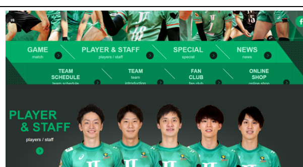
The Volleyball team promotes JT brand name

Other sponsored activities include JT Japanese Chess Championship, 30 JT Cup Golf Japan series 31 and JT Sports School. 32