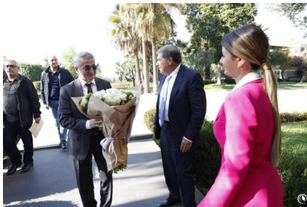
Minister of Finance El Khalil visiting the Regie

"the institution of hardworking that harmonizes the resources of the earth with the sweat of its descendants, to produce quality and returnable, preserving their decent and free living on the one hand, and providing the state and its treasury with revenues on the other hand, while today it is in dire need of every penny, to rise from its most difficult situation on financial, economic, social and various other fields, especially the political and constitutional complexities' (19 December 2022) 57 .