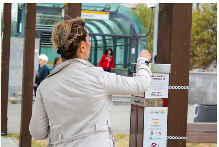
BAT logo on the cigarettes butts collection devices installed by the local City Hall.

During October-December 2019, BAT announced concluding partnerships with local City Halls on cigarette butts collection. <sup>35 36</sup>