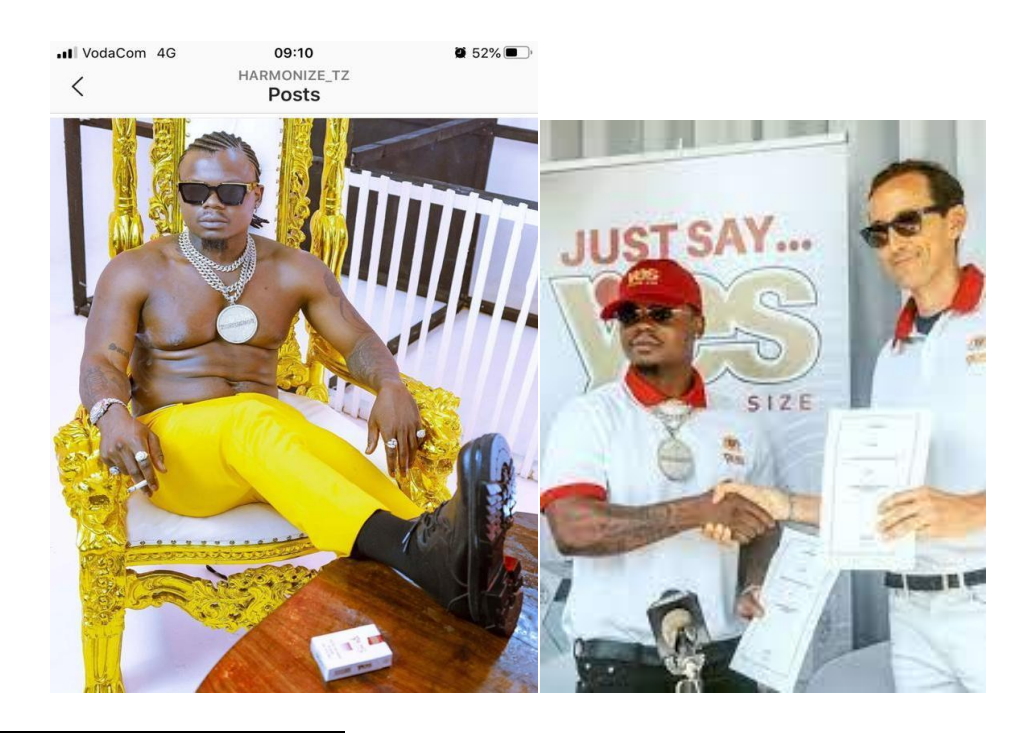
<sup>28</sup>Tanzania: Harmonize named tobacco brand ambassador. <u>https://bit.ly/3ebHcex</u>