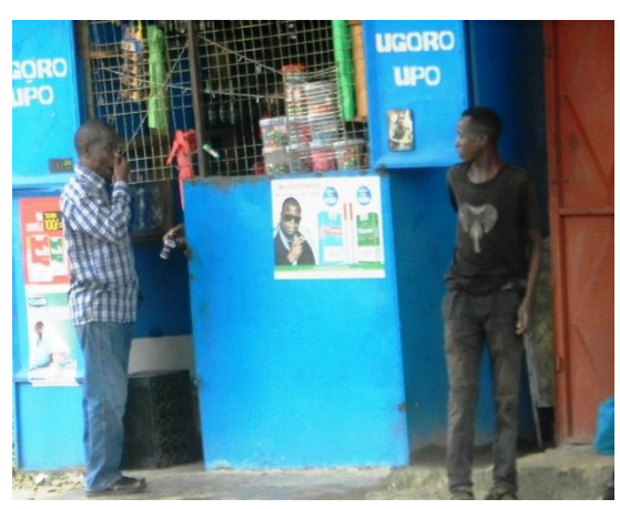
Advertising Harmonize brand and snus (ugoro)