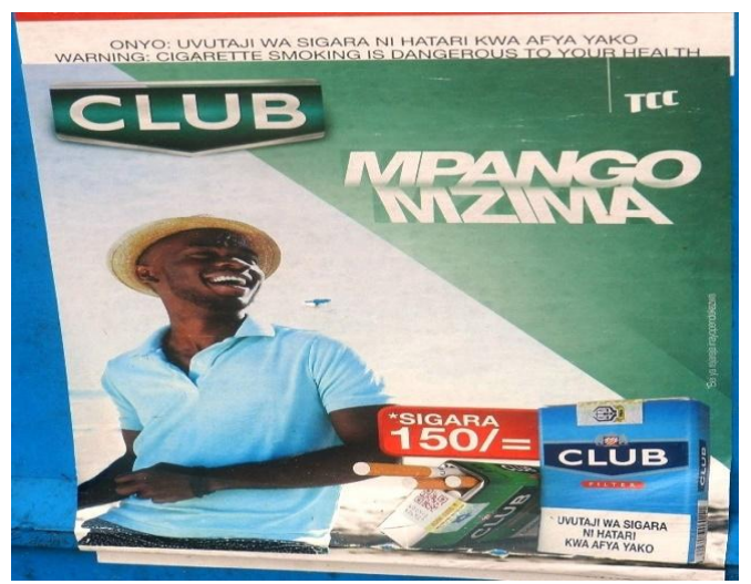
TCC advertising Club cigarettes Mpango Mzima (The big deal)